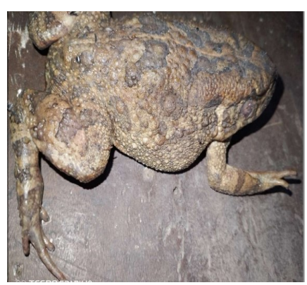
Plate 1: Sclerophrys maculata