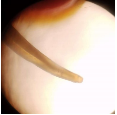
Plate 6: Ophidascaris (x10)