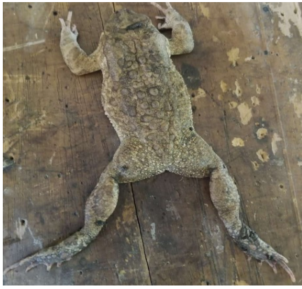
Plate 4: Sclerophrys steindachneri