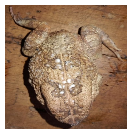
Plate 3: Sclerophrys regularis