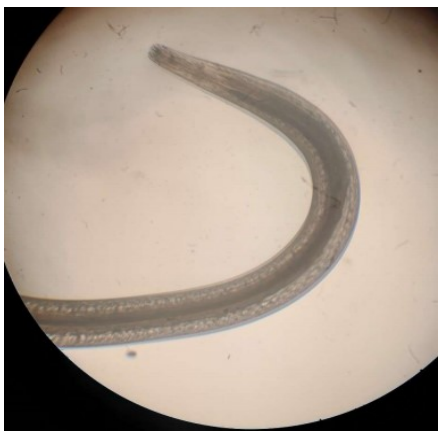
Plate 8: Encysted Larval Ascaridida (x10)