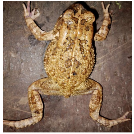
Plate 2: Sclerophrys pusilla