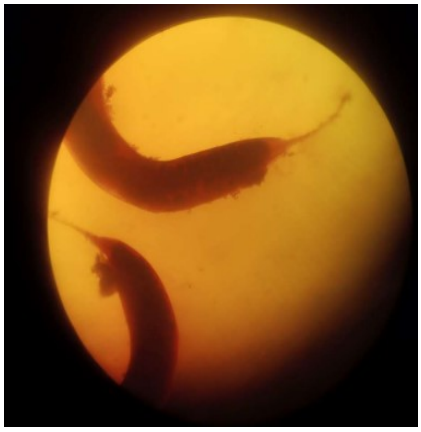
Plate 7: Capillaria (x10)