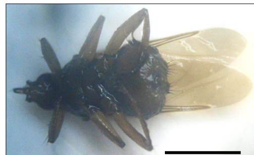
Plate 3. Ventral view of Pseudolynchia canariensis . Scale-bar = 230µm