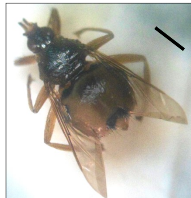
Plate 4. Dorsal view of Pseudolynchia canariensis . Scale-bar = 230µm