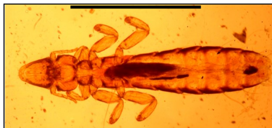
Plate 2: Ventral view of Columbicola columbae . Scale-bar = 130µm