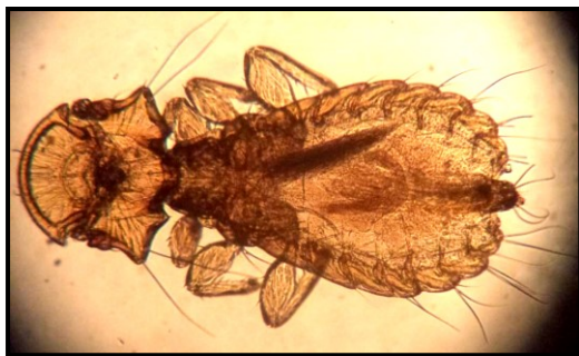
Plate 1. Ventral view of Gonoides sp. Scale-bar = 120µm